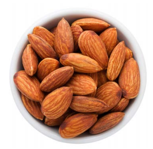
A glass of Coca Cola has exactly the same number of calories as a handful of almonds.

The body processes refined foods or refined products containing a lot of simple sugars combined with bad fats, flavour enhancers and possibly chemical sweeteners in a completely different way to natural nutrition. Out in the wild, pizza doesn't grow on trees: so this combination of fats and carbohydrates is unnatural. Our metabolisms and innate instincts in particular are manipulated, bypassing our bodies' sense of satiation.